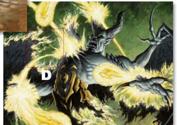
A: Wand of the Elements B: Myr Matrix C: Auriok Siege Sled D: Purge

Turns out they were all from Darksteel .